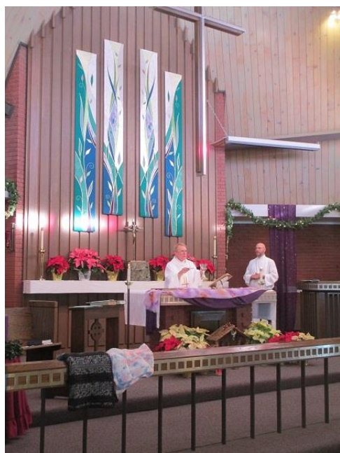
Consecrating the elements for Eucharist at St. Martha's Episcopal Church in Westminster, Colorado.