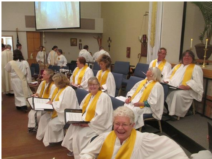
Some of the St. Matthew's Episcopal Church choir, Grand Junction, Colorado.