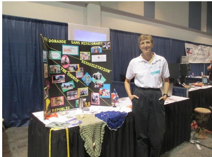
At my display table at diocesan convention, Oct 2014.